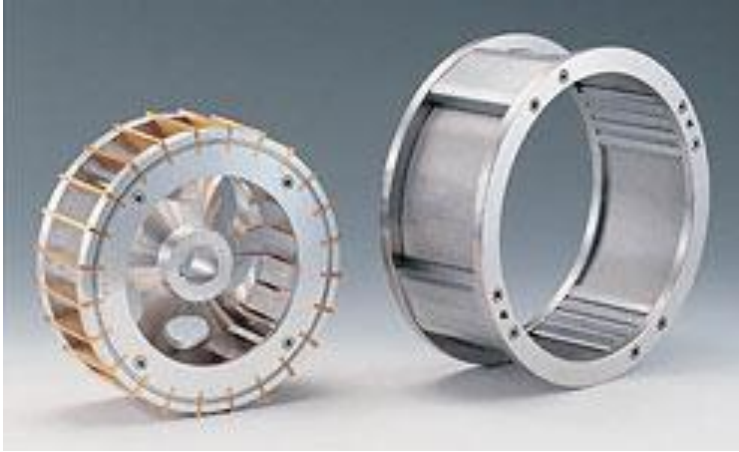
Turbo Rotor / Grinding plate sieve ring